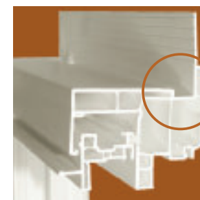
* Patent-pending "Stucco Gutter"